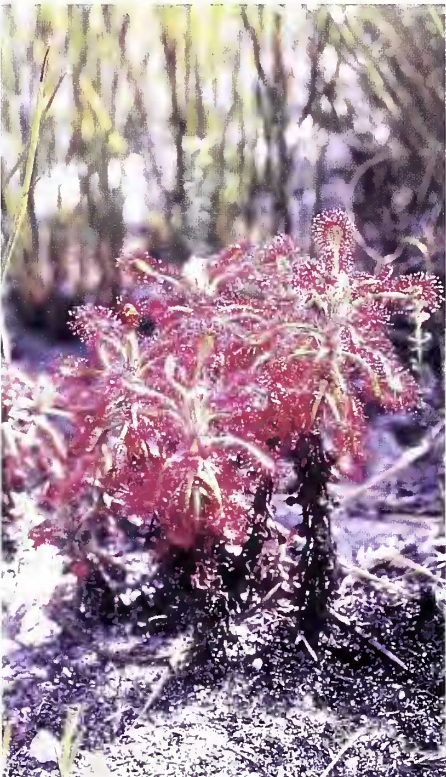
Figure 2: Drosera glabripes at Hermanus.